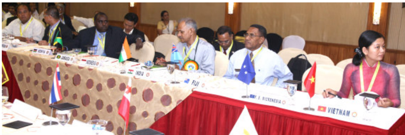
APCC country representatives

2a. Recognizing the stagnant if not decreasing productivity of coconut farms, the meeting recommends that in order to increase coconut farm productivity, the National Governments of the APCC member states must support and provide appropriate budget for a National Coconut Replanting/Rejuvenation Program including intercropping, product diversification and value addition with provisions for technical assistance and capacity building.