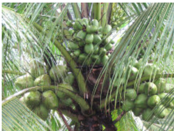
Chawghat Green Dwarf