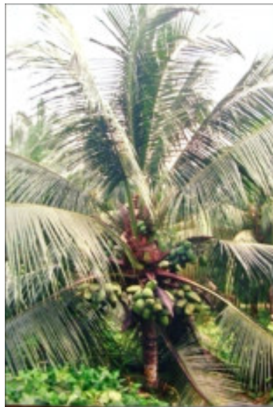
Sri Lankan Green Dwarf

etiological studies confirmed the disease of phytoplasma origin. Root wilt disease still evades a perfect control measure. But the production and productivity can be improved through proper management strategy. CPCRI has evolved different effective management strategies to contain the disease and to improve productivity of root wilt affected palms and gardens. Breeding for root wilt disease has resulted in a high yielding disease tolerant hybrid variety with Chowghat Green Dwarf as the female parent and West Coast Tall (WCT) as the male parent. This has been evaluated and released for the root wilt affected tracts under the name Kalpa Sankara. Chowghat Green Dwarf (CGD) and Malayan Green Dwarf (MGD) have been evaluated as root wilt resistant/tolerant varieties and have been released by the institute for cultivation in the root wilt affected tracts under the name Kalpasree and Kalparaksha respectively. Phenotypically healthy palms exhibiting tolerance to root wilt has