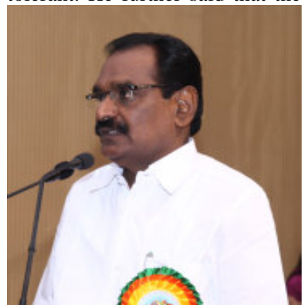
Shri. S Damodaran, Minister for Agriculture, Government of Tamil Nadu

Shri. S Damodaran, Minister for Agriculture, Government of Tamil Nadu in his presidential address called upon the scientists to identify new technologies for developing new varieties of coconut which are disease resistant and drought tolerant. He further said that the