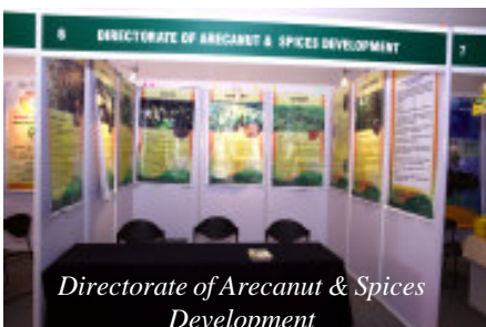
Directorate of Arecanut & Spices Development