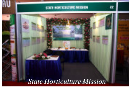
State Horticulture Mission