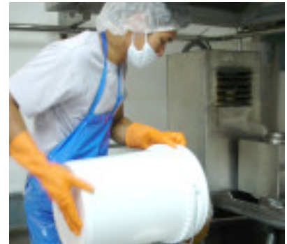
Processing of coconut sugar at Chiwadi

The other markets are USA and Canada. Chiwadi is planning to develop more modern products with traditional wisdom. Vinegar and natural fruit juice sweetened with