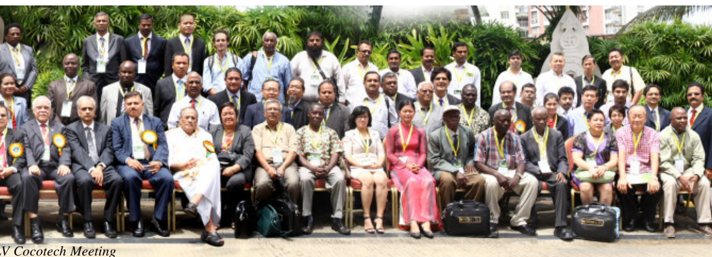
V Cocotech Meeting