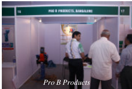
Pro B Products