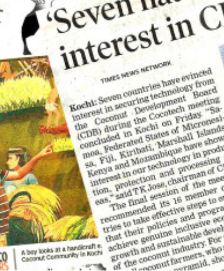
A boy looks at a hand-drawn diagram of a coconut tree at the Cocotech International Coconut Community in Kochi.

through increased productivity. The potential of coconut as a food and beverages crop should also be fully exploited," he added. Around 200 delegates from different countries are attending the five-day meet to share their knowledge and expertise as well as deliberate upon the future course for APCC. The conference, with the theme "Inclusive Growth and Sustained Development of the Coconut Industry"