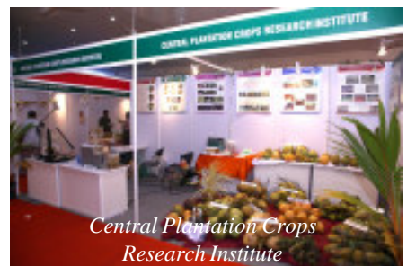
Central Plantation Crops Research Institute