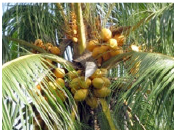
Sri Lankan Red Dwarf