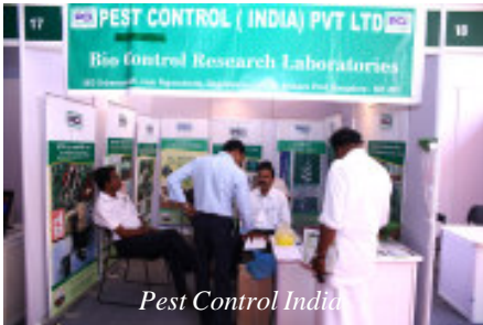
Pest Control India