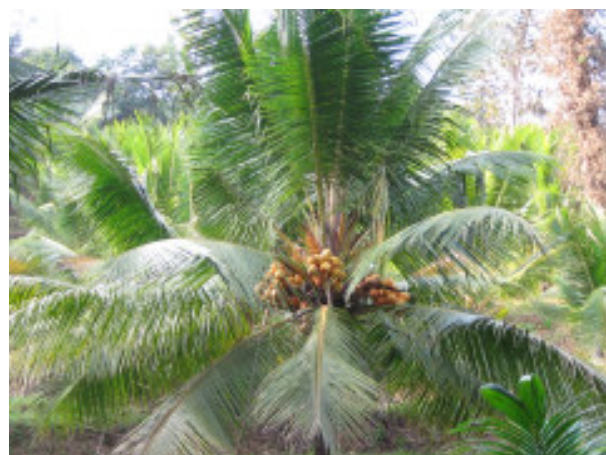
Chawghat Yellow Dwarf