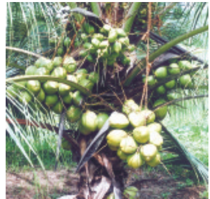
Kalpasankara - a cross between CGD and WCT

Coconut Development Board in India has initiated a collaborative research for increasing the availability of hybrid seedlings of various combinations through academic institutions where post graduate courses in botany, Zoology or biotechnology are available. Colleges can identify mother palms of desirable Dwarfs in farmers' fields and can carry out