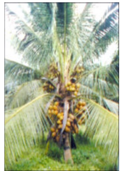
Sri Lankan Green Brown