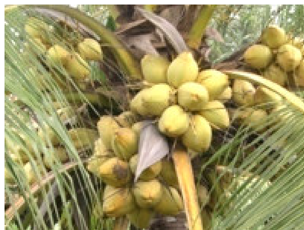
Sri Lankan Yellow Dwarf

also been located in hot spot areas of the disease. Farmers collect seednuts from such 'Elite' palms.