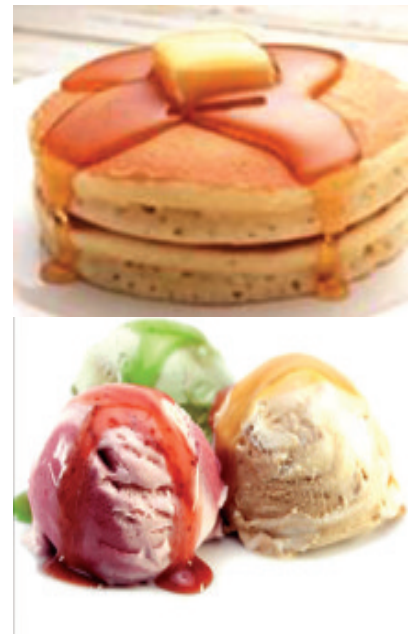
Desserts topped with coconut syrup