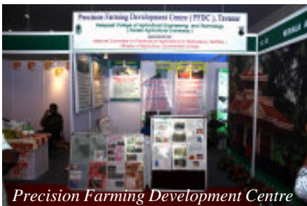
Precision Farming Development Centre