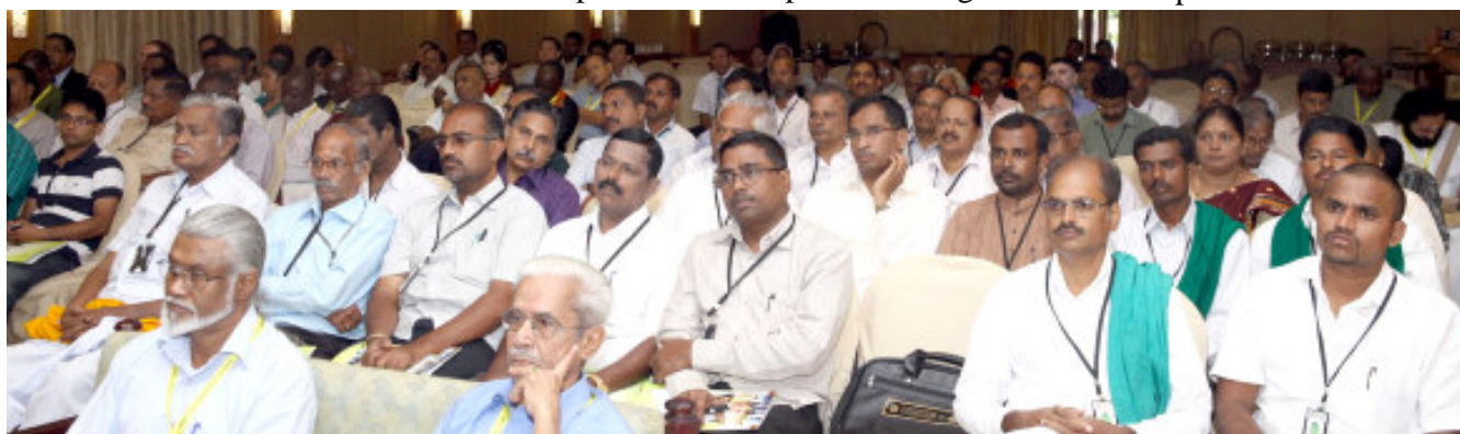
Farmer's Interface - A view

60 farmers from across the country took part in the discussion which followed an interaction with technical experts.