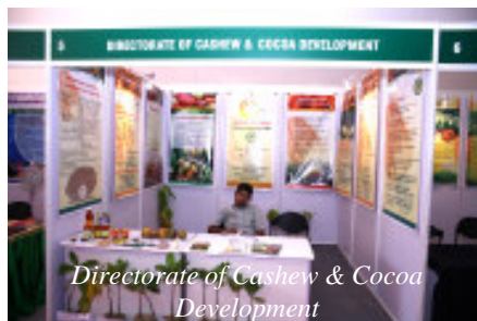
Directorate of Cashew & Cocoa Development