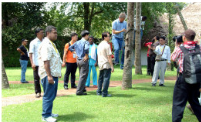
Delegates during the field visit

India's continuing efforts in developing coconut and coir industries that contribute substantially to its rural economy and foreign exchange earnings, received wide appreciation from a cross section of foreign