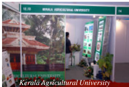
Kerala Agricultural University