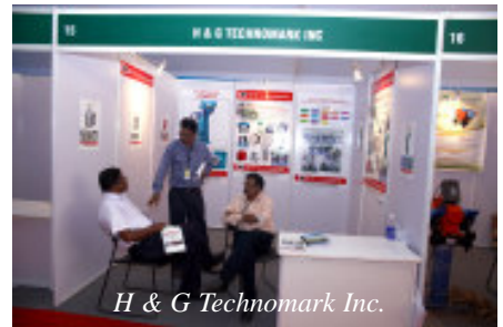
H & G Technomark Inc.