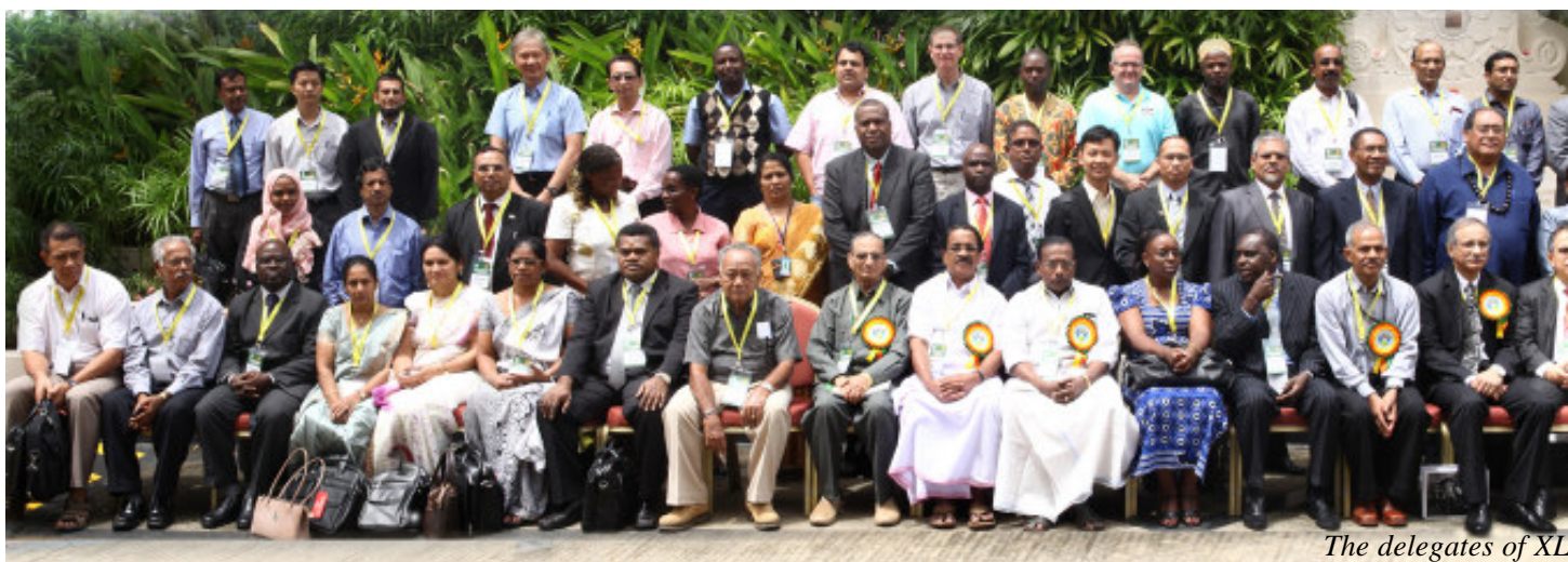
The delegates of XLVIII