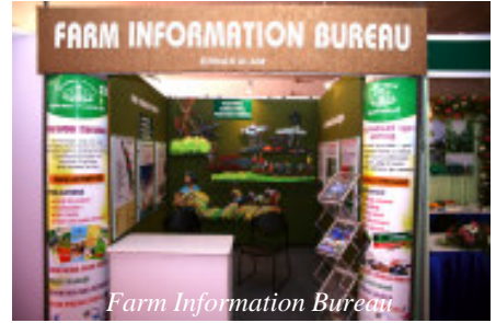
Farm Information Bureau