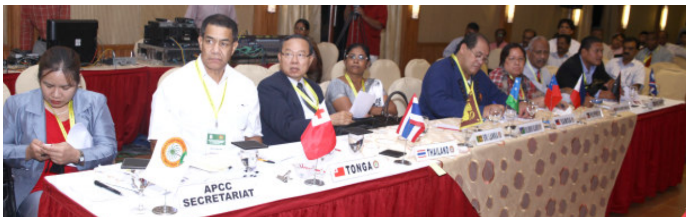
APCC country representatives

A Committee composed of all heads of country delegations in APCC member countries and chaired by the APCC Executive Director formulated the recommendations after deliberating on the issues raised in the technical presentations and question and answer sessions: