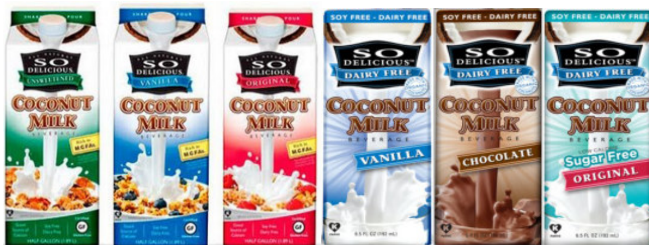
Multiflavored coconut ice cream and milk beverages