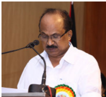
Prof. K V Thomas, Union Minister for Consumer Affairs, Food and Public Distribution

coconut and coconut products can be achieved only through increased productivity. Coconut was predominantly considered as an oil seed crop in India. The potential of coconut as food and beverage crop also has to be fully exploited. Lowering of import tariff, increased market access and the free trade