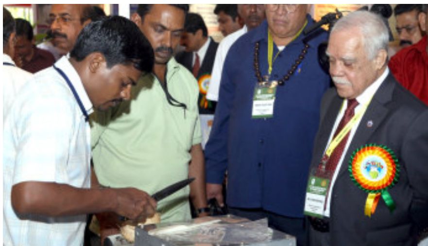
Shri. Le Mamea at the Coconut Festival 2012, Kochi

For the first time in the history of Samoa, we introduced a Five Year Plan for Agriculture from 2012. Replanting and promoting intercropping and productivity improvement formed the thrust area in coconut which is christened as 'Stimulus Package'. Main objective is to promote replanting of coconut as a base crop, intercropped with cocoa, coffee and other selected fruit crops and pastures as a way to increase farm productivity and thereby increasing farm income and the standard of living of the rural farm communities. The intention is to replace senile trees which account for 25% of the total palm population in Samoa, with new seedlings. Crops like taro, cocoa and coffee and vegetables are grown as intercrops apart from fisheries. Incentive @ 500 Tala (Samoan currency) per acre is extended to farmers who are willing to plant minimum 2 areas. A bonus payment is made to the participating farmers at the end of second, third and fourth year for the proper maintenance of the gardens. Cost of coconut seedlings for replanting and their transportation charge are met by the government. Technical expertise is given through the extension advisory services of the Ministry of Agriculture and Fisheries. Income generation and