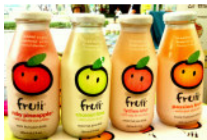
Fruii in various flavours

Fruii the ready to drink fruit juice was the third product launched by Chiwadi in 2012. This drink in various fruit flavours is sweetened with coconut flower syrup. This product was awarded with Innovation Coupon Programme by Industrial Federation of Thailand.