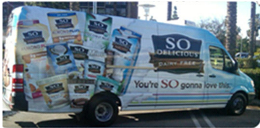
Mobile road show

'So Delicious Dairy Free' has positioned itself through the quality of its products and by exceeding customers' taste and health expectations. This combination appeals to the growing population of dairy alternative seekers who wish to change their diet without compromising on taste or quality follows the strategy of Advocacy Marketing Model .