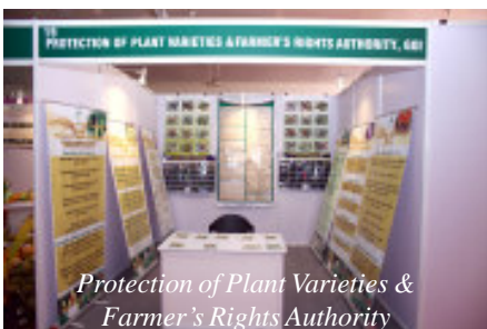
Protection of Plant Varieties & Farmer's Rights Authority