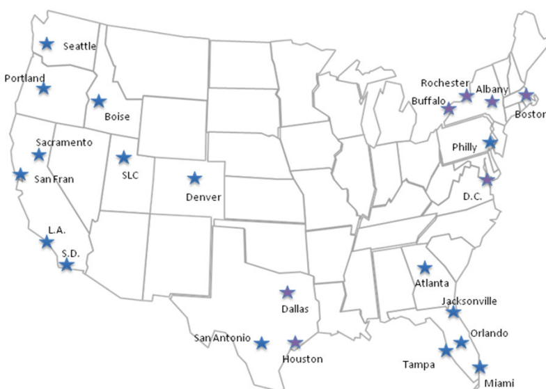
Market chain in America