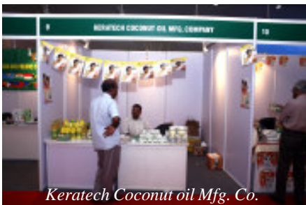
Keratech Coconut oil Mfg. Co.