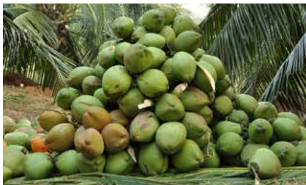
Table 6: Weekly price of coconut at major markets (Rs /1000 coconuts)

At Nedumangad market the price of partially dehusked coconut opened and closed at Rs. 21000 per thousand nuts. At Pollachi market in Tamil Nadu, the price of coconut opened at Rs. 18000 and closed at Rs.16000 per thousand nuts with a net loss of Rs.2000 per thousand nuts. At Bangalore APMC, the price of partially dehusked coconut opened at Rs. 25000 and closed at Rs. 27500 with a gain of Rs.2500 per thousand nuts during the month. At Mangalore APMC market the price of partially dehusked coconut of grade-I quality opened at Rs.25000 per thousand nuts and closed at Rs.23000 per thousand nuts with a net loss of Rs.2000.