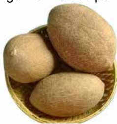
Table 4 : Weekly price of Ball copra at major markets in Karnataka (Rs/Quintal)

The price of ball copra at Tiptur market which opened at Rs.12500 per quintal expressed a mixed trend during the month and closed at Rs.13000 per quintal with a gain of Rs.500 per quintal.