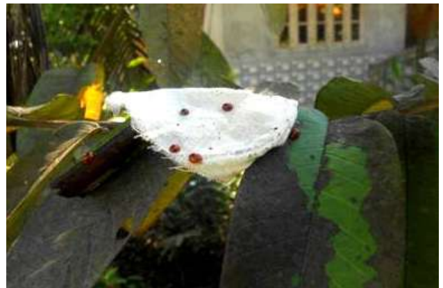
Establishment of released sooty mould feeding Leiochrinid beetles in Assam

Significant deposition of sooty mould on the upper surface of palm leaflets is quite visible impairing photosynthesis and this forms the characteristic symptom of pest attack. Some farmers of the region are of the opinion that the fumes from the plastic industry nearly could be responsible for the blackening of palms. Furthermore, enhanced senescence of older palm leaflets could be observed with no death of the palm recorded in any of the region under surveillance. The pest damage could be observed visibly on tall palms along the roadside in Damdama, Hajo and Kalitakuchi regions of Kamrup district as well as in Bijulighat, Barkuriha, Madhapur, Katpua regions of Nalbari district (Table 1). RSW incidence is quite prominent along the Highway road side and is reduced considerably on coconut palms in the interior region away from the Highway side thereby indicating the spread of the pest mainly localized along the vehicular movement zones carrying the infested materials.