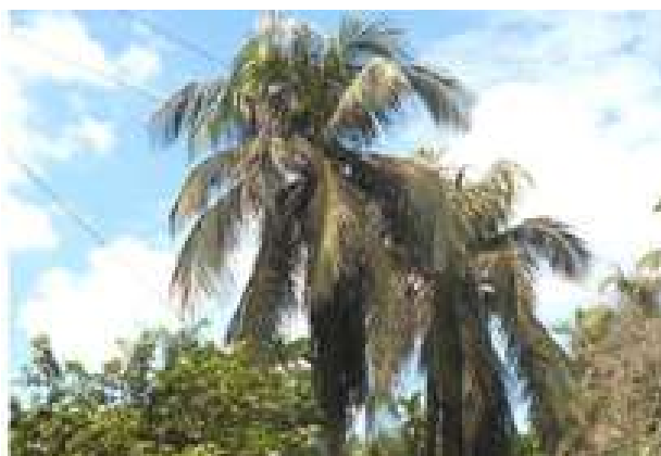
RSW damaged palm in Assam

In this context, widespread distribution of the rugose spiralling whitefly, A. rugioperculatus was observed on coconut palms in different hamlets of Kamrup and Nalbari districts of Assam in August 2018.