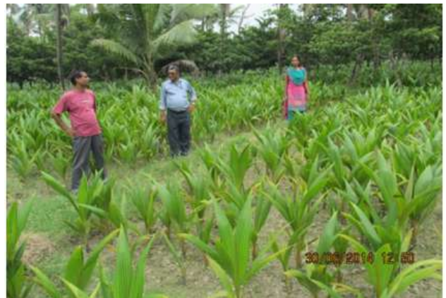
Nursery at CDB, Madhepura farm

has been found to be suitable for coconut cultivation (See Fig-1). The zone experiences an average minimum temperature of 8.8°C and maximum temperature of 33.8°C. This zone has a network of rivers like Bagmati, Kosi and other small rivers, thus humidity is quite high as compared to other areas of the state.