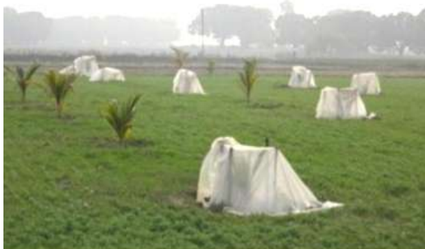
Seedlings protected from frost damage