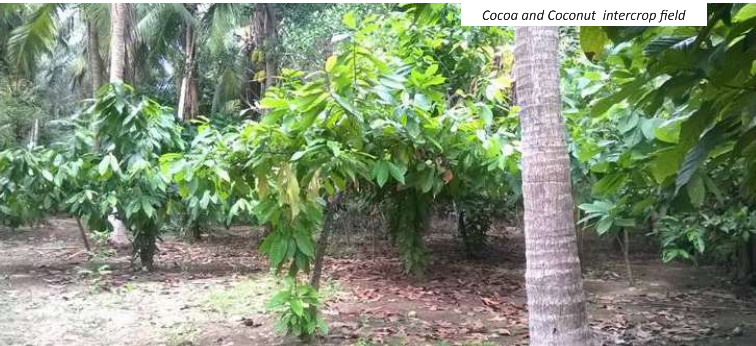
Cocoa and Coconut intercrop field

centres at Veppankulam, conducted many cultural, manurial and chemical trials for the past few years with a view to controlling or managing the Thanjavur wilt/ Ganoderma root rot. Technologies have been evolved and more awareness programmes and