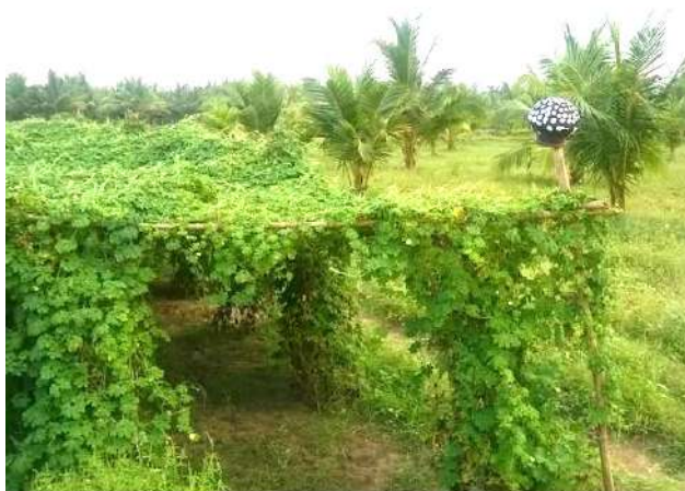
Vegetable intercropped field

demonstrations are being carried out among the coconut growing farmers to mitigate the problem by wilt disease and give guidance to improve the productivity of the coconut. Diversified cropping system could be one of the solution to realize sustainable productivity and maximum income per unit area of land besides maintaining soil fertility by the recycling of by-products of crops since land being a renewable resource, must be put to maximum use for increased crop production. Better space utilization was understood by the coconut farmers in the coconut based cropping system (CBCS) which not only helps in space utilization but have also known about the complementary effects of intercrops in coconut gardens. It is one of the most appropriate system, which can be easily adopted by the coconut growers. Banana, black pepper, cocoa and vegetables are the suitable intercrops for the East coast region of Tamil Nadu. The farmers grow cocoa as one of the best intercrop in their coconut plantations and generate a profitable income with an average price of Rs. 150 – 200/- per kg of dried cocoa beans. Apart from this, coconut and cocoa crops has a buy-back system and assured market in the country. Here is the success story of a farmer from Thanjavur district who has adopted the cocoa as intercrop in coconut .