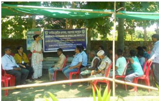
Awareness meeting at Tilana