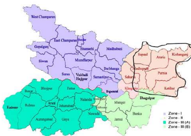
Fig. 1 Agroclimatic zones of Bihar

The state of Bihar is a land-locked state situated on the eastern part of India. It is situated between 83°-31' to 88°-00' E longitude and 21°-58' to 27°-31' N latitude. The climate of Bihar is mostly semi-arid, sub-tropical, experiences moderate rainfall, hot summer and cold winter. Nevertheless, this region being close to Tropic of Cancer experiences tropical climate during summer. Average maximum temperature is 35°-40°C throughout the summer months and the average minimum temperature during the coldest month of December and January goes down to 5° to 10°C. Bihar gets its maximum rainfall during South-West monsoon season which prevails from June to September. The natural precipitation ranges between 990 mm and 1700 mm, with an average annual rainfall at 1205mm. Thus the climate of Bihar is not much suited for the cultivation of all plantation crops, even though the