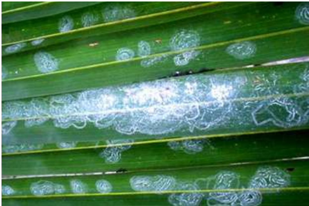
Egg colony on under surface of leaflet

variegatum ) could be highlighted. Few farmers have reported its occurrence on betel vine as well. Occurrence of RSW in different hamlets of Kamrup and Nalbari districts is presented in Table 1.