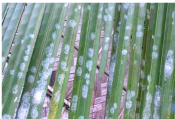
Spiralling pattern of egg laying

In the surveillance survey organized by ICAR-CPCRI, a new distributional report of the pest in North-East region (Assam) on coconut palms and to a limited extent on the arecanut, ornamental yellow palms, banana and certain croton species ( Codeum