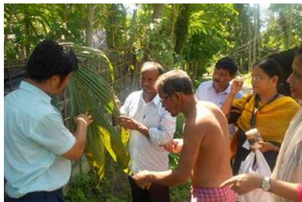
Distribution and release of sooty mould feeding beetle in Assam