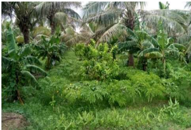
Coconut based cropping system in Bihar