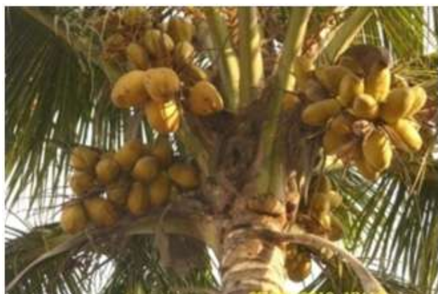
High yielding germplasm

Hence proper policy should be made for optimum utilization of facilities and bringing additional area under coconut cultivation the suitable region.