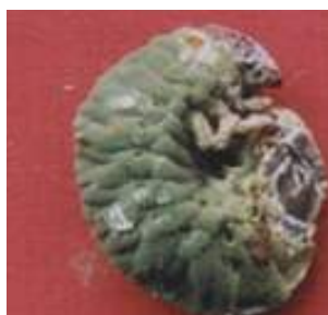
M anisopliae infected grub