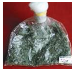
Mass multiplication of M anisopliae

the weather slowly turns dry and at the same time become cool with the opening up of winter season. Cool and dry period triggers pest occurrence in the perennial system including coconut plantations.