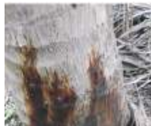
Basal stem rot disease