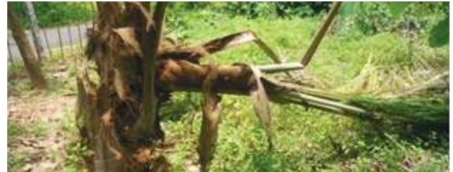
Toppling of palm