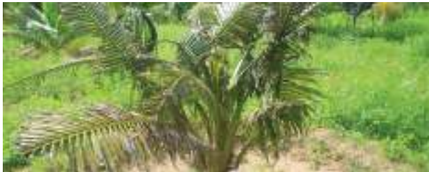
Leaf rot disease in juvenile palm