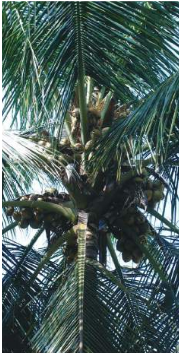
Table 1. Details of coconut varieties released by ICAR-CPCRI for the root (wilt) disease prevalent tract

K alpa Vajra is an improved West Coast Tall variety developed by ICAR-CPCRI and it is recommended for the root (wilt) disease prevalent tract. It was recommended for release during the Annual Group Meeting of All India Coordinated Research Project (Palms) held at ICAR-CPCRI, Kasaragod during 16-18 th September 2022. ICAR-CPCRI had earlier released three coconut varieties for the root (wilt) disease prevalent tract (Table 1). Kalparaksha was notified and released by Central Variety Release Committee (CVRC) during 2008 and Kalpasree and Kalpa Sankara were notified and released by CVRC during 2012. It is after a gap of ten years, ICAR-CPCRI is recommending a coconut variety specifically for the root (wilt) disease prevalent tract. Since this variety was recommended for release during the platinum jubilee anniversary of ICAR-CPCRI, Regional Station Kayamkulam, it was aptly named Kalpa Vajra.