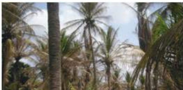
Slug caterpillar infested field