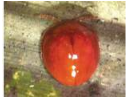
Sooty mould scavenging beetle