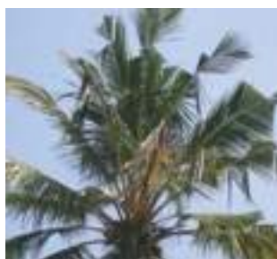
Spear leaf damage