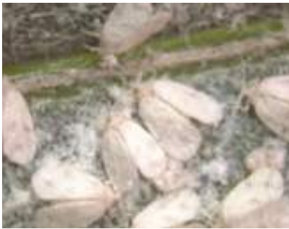
Colony of rugose spiralling whitefly